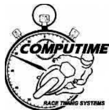
Clerk of Course - Paul Cansdale

Computime Race Timing Systems Pty Ltd © 1996-2008